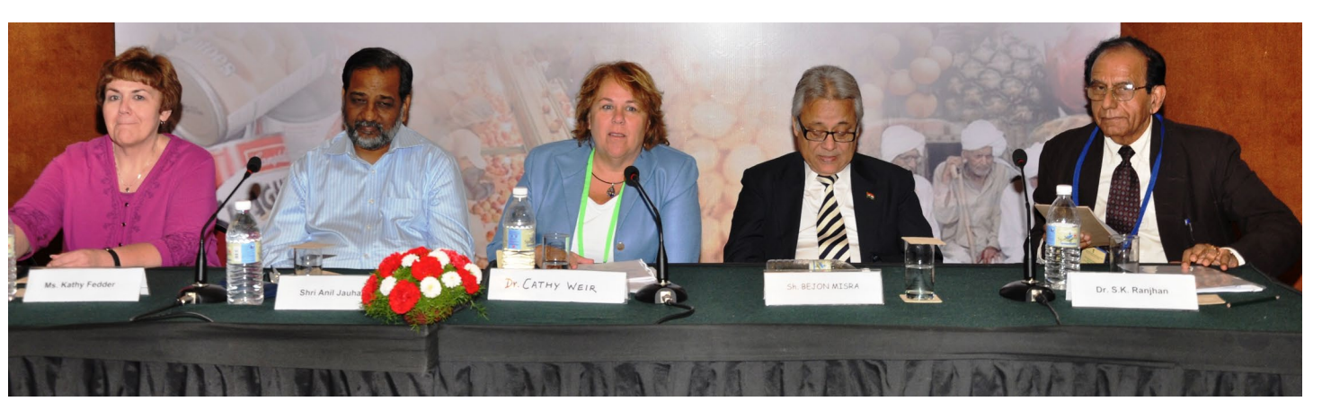
Workshop discussion panel.

India has a very divergent food system in that unorganized and mobile street food vendors comprise a large part of domestic food access, and yet India also must focus on challenges related to its role in international markets. The challenge is to ensure