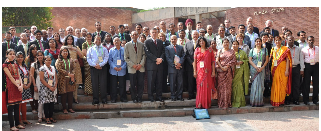
Attendees at the work shop.